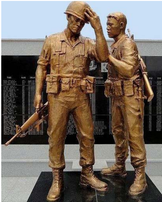
Korean War DMZ Memorial in Seoul