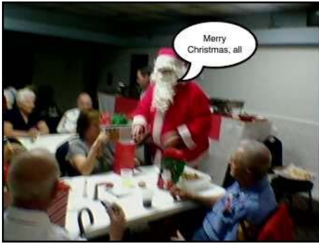
And finally old' Santa arrives, dispensing his good cheer and gifts for all. Afterwards, Santa posed for pictures and hugs for all, and assuring all that he would return next year.