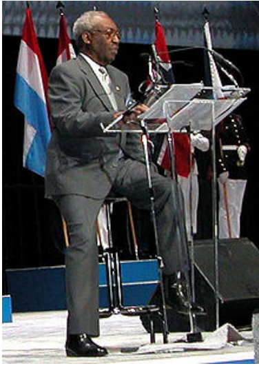
McEachin reads a narrative on the conflict at a Department of Defense salute to the Korean War in 2003.

As mentioned earlier, James McEachin was one of the six Korean War veterans, along with Medal of Honor recipient Hiroshi H. Miyamura, selected to ride on the Korean War Veterans float in the 2013 Rose Parade.