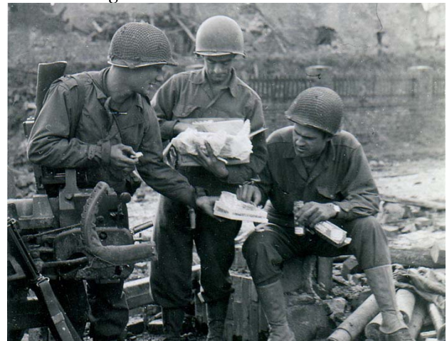
Christmas packages have always been welcomed by troops no matter where they are. This picture was taken during WWII in Europe.